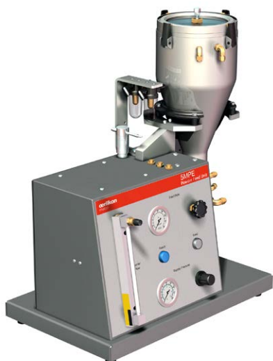
5MPE – Standard Configuration

The space-saving, tabletop design has a hopper that is simple to fill and clean out. Operation of the 5MPE is simple, using a precision rotameter to control carrier gas flow and easy to read and set pressure gages to control carrier gas flow and the rate of powder feed. Solid state electronics ensure dependable operation.