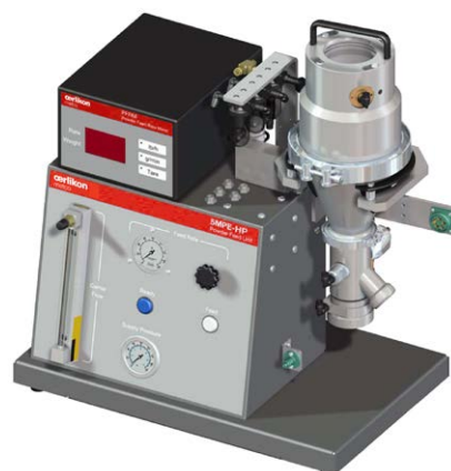
5MPE-HP – Standard Configuration (includes PFRM Powder Feed Rate Meter)