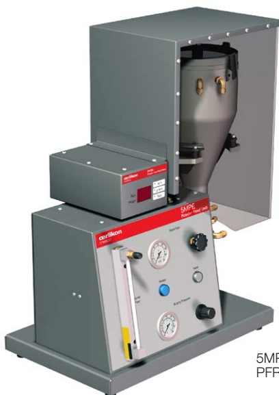
5MPE – Configuration with optional PFRM Powder Feed Rate Meter and PFRMW Wind Cover