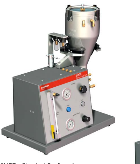
5MPE - Standard Configuration

The space-saving, tabletop design has a hopper that is simple to fill and clean out. Operation of the 5MPE is simple, using a precision rotameter to control carrier gas flow and easy to read and set pressure gages to control carrier gas flow and the rate of powder feed. Solid state electronics ensure dependable operation.