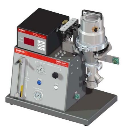
5MPE-HP – Standard Configuration (includes PFRM Powder Feed Rate Meter)

5MPE – Configuration with optional PFRM Powder Feed Rate Meter and PFRMW Wind Cover